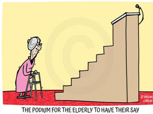
THE PODIUM FOR THE ELDERLY TO HAVE THEIR SAY