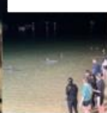
Some dared the cold while others watched from the warmth of the jetty.