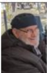
The ancient Mariner