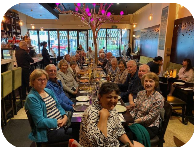
Eating again - Lygon St. Melbourne