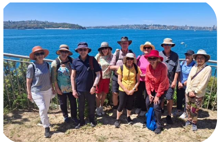
Back home, to walk it all off, Middle Head/ Balmoral