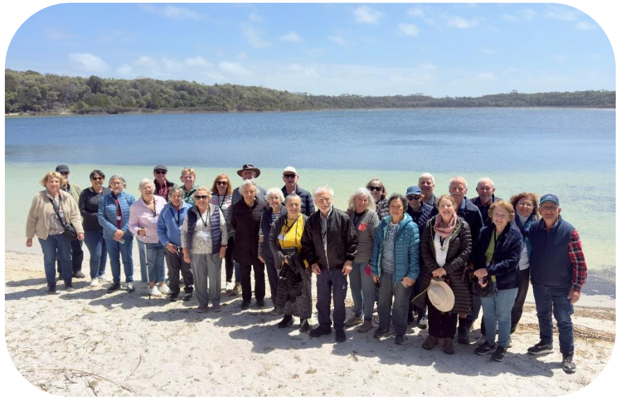
Barbarians (?!) from the