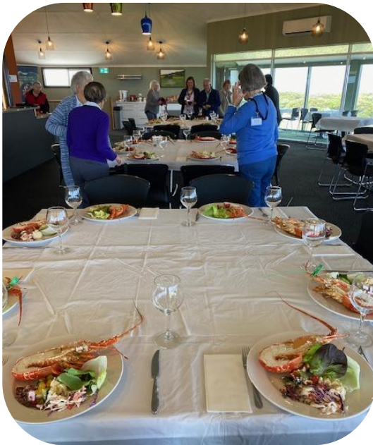
Lunch is served on King Island north pose at Penny's Lagoon, King Is