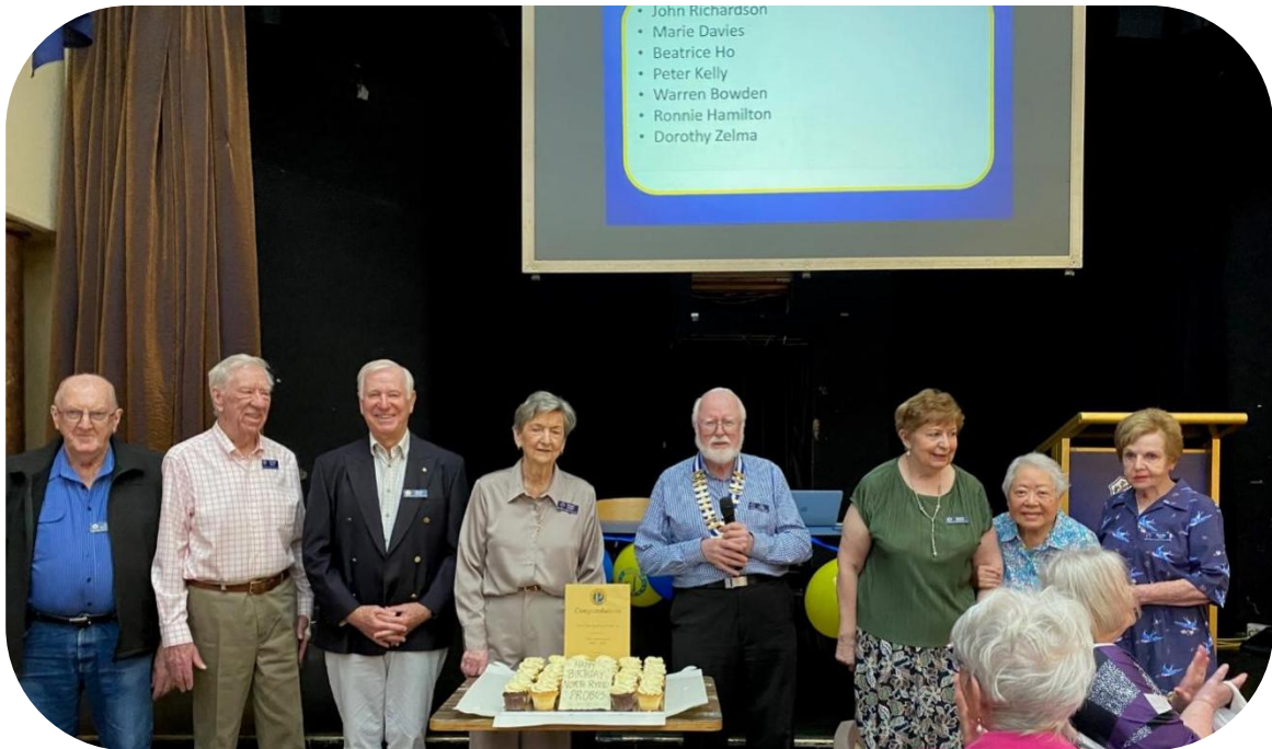
Presidents Past & Present