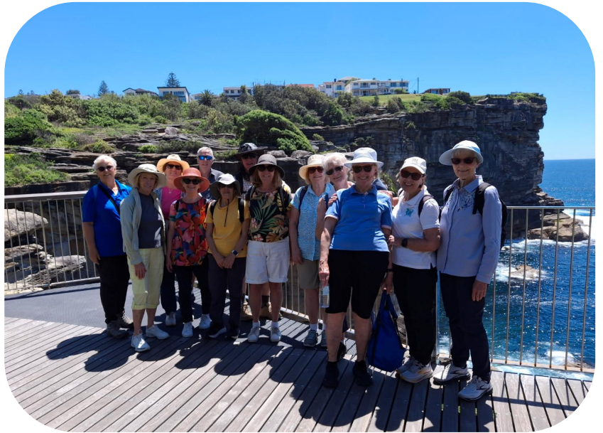
Walkers from The Gap to Diamond Bay to ....lunch!