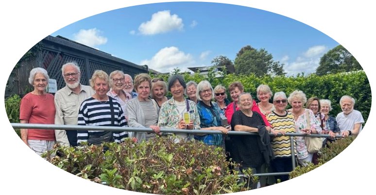
Jacaranda festival trippers revelling indoors and out