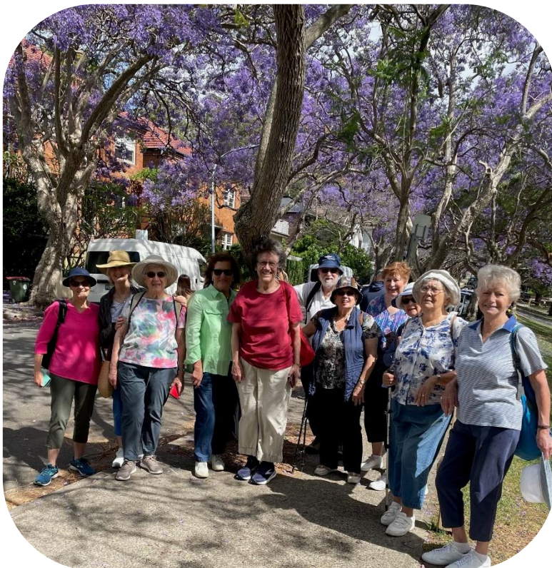
WOW Walkers amongst Jacaranda trees at Milsons' Point