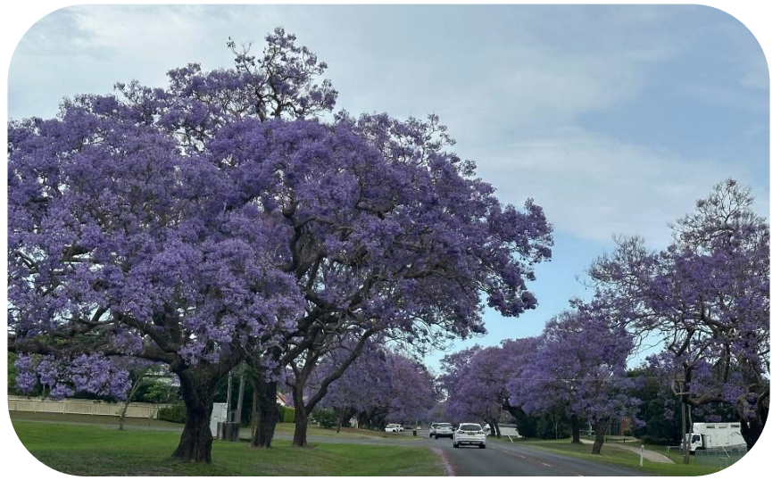
Checking out Golden Guitars on way to Grafton Jacaranda Festival