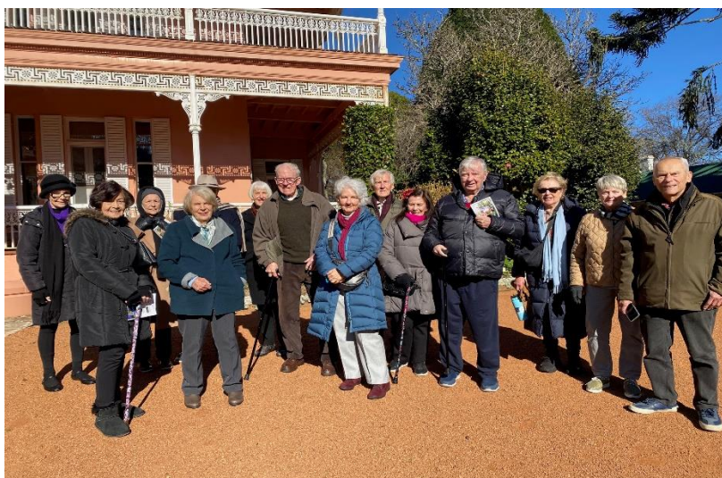
Probus Club members at Retford Park, Bowral