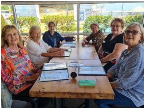
Members enjoying a lovely lunch at Wharf Hotel it Queens Wharf, Newcastle