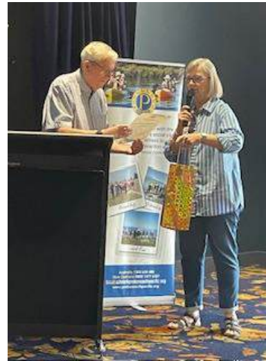
Christmas Party Shenanigans