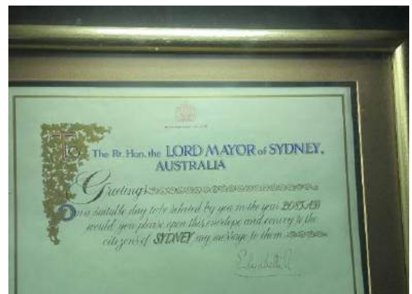
The contents of this letter, from Queen Elizabeth II to Lord Mayor of Sydney, are unknown. The letter is to be opened on a suitable day in 2085.