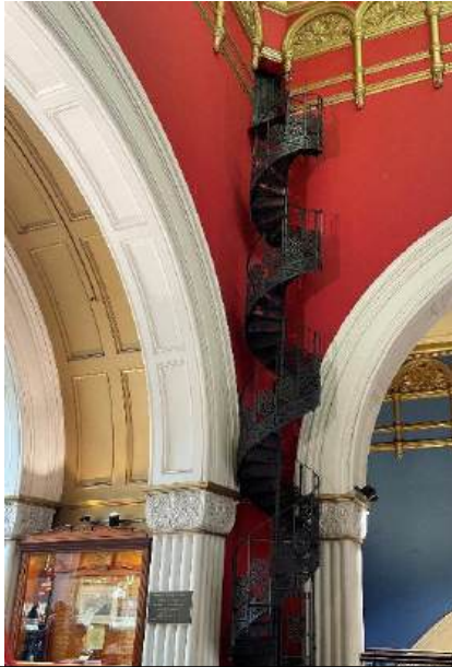
The spiral staircase leads to a passage between the glass dome and the outer copper dome.