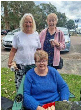
Members braving the weather to have a picnic at the Rocket Park