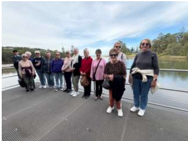
moment lagoon. boardwalk