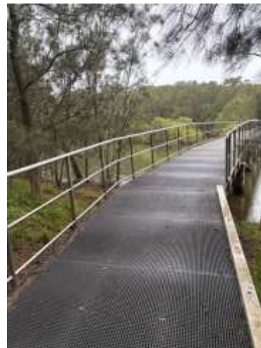
Kodak beside the Puckley's