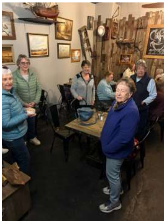
Ready to go