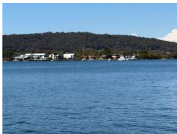
Water views along the way