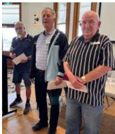
Footy Tipping - 3 Winners