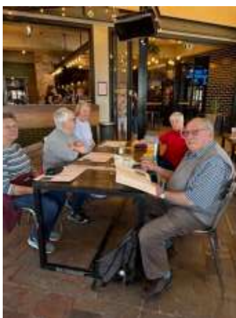
Lunch at the Bayview