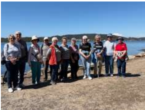
A Kodak moment

After our traditional coffee stop at Central, we caught a new Mariyung Intercity train to Woy Woy. One of our great rail journeys, the trip provided scenic views as it snaked its way around the Hawksbury River foreshore on its way to our destination. Our walk followed the scenic, foreshore walkway past the many tastefully renovated waterfront cottages and manicured lawns, until heading back towards the village for a refreshing beverage and lunch at the Bayview Hotel. After lunch it was a short stroll to the station where we boarded a Sydney bound train to start our journey home.