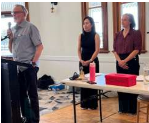
Guest Speakers from Sydn Uni on Osteoarthritis