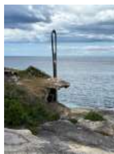
Geraldo Zamproni's 'Vital Threads'