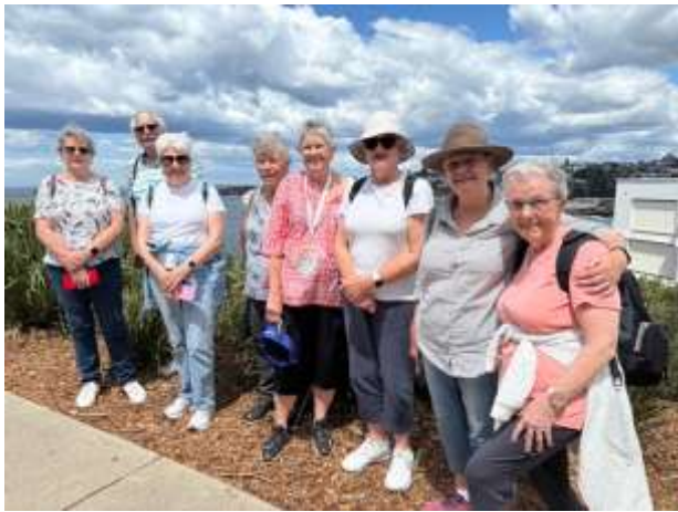
We pause for a kodak moment

After postponing the walk, on the 20 th FOMO on Sculptures by the Sea, (one of Sydney's must-see experiences) was a concern. So, the next Monday nine of us rode our usual train to Bondi Junction. After our mandatory coffee stop, we took a short bus trip to start our walk. The weather was ideal as we wandered along the back roads of Bondi to arrive at the fantastic exhibition of local and international artists' work in a stunning coastal setting. After a relaxing stroll around the coast and admiring more works, lunch was taken at the secluded Tamarama beach park, before we headed home.