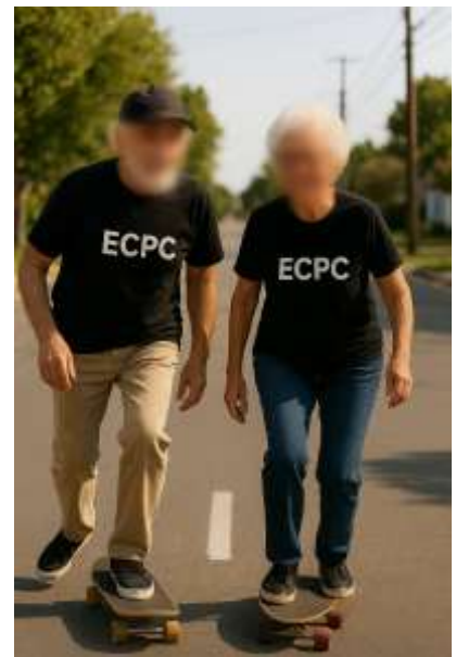
created by Chatgpt (Thanks Di!)