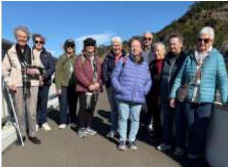
Kodak moment on the bridge the Imperial

11th August Rozelle to Pyrmont Cancelled due to weather