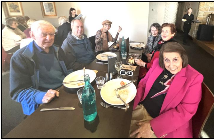
Au Petit Escargot