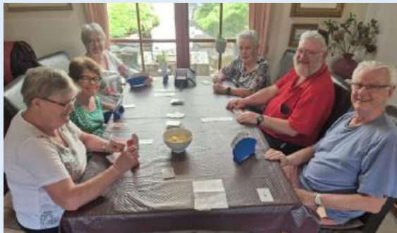
The canasta competitive cohort!