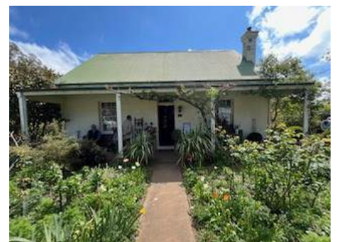
Red Cow Farm, Moss Vale