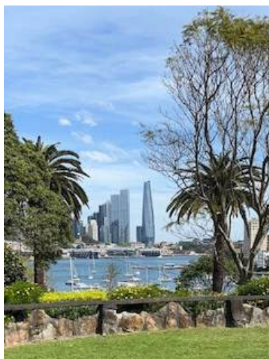
Clark Park, Milsons Point