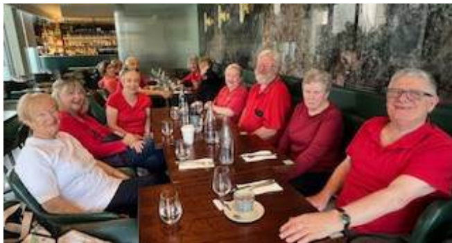
Lunch at Sidando Restaurant, Milsons Point