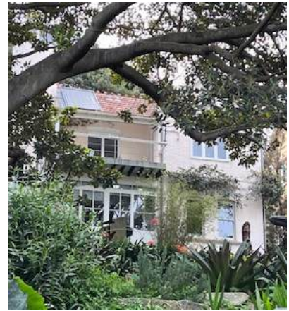
Wendy Whiteley's Home

Red Cow Farm is located in Sutton Forest, NSW, and is a private cool-climate garden open to the public from mid-September to mid-May. The garden is divided into approximately 20 themed "rooms," offering a diverse and unique botanical experience with imaginative landscaping.