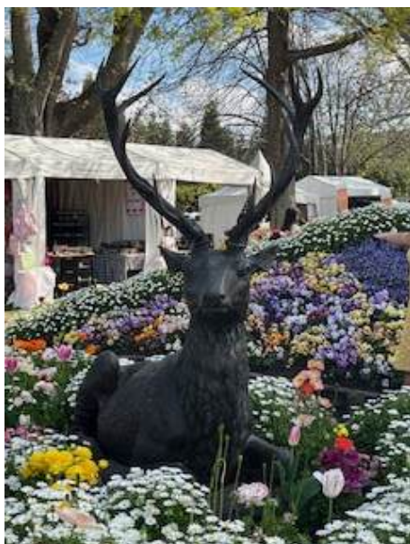
Bowral Tulip Festival