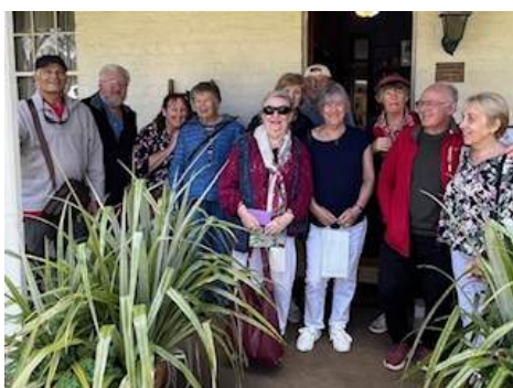
Red Cow Farm, Moss Vale