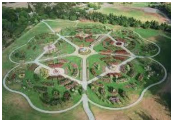
Victoria State Rose Garden

The day will include morning tea from the bus, a tour of the Mansion, a visit to the Rose Garden and a two-course lunch at the Werribee RSL. The Trip will depart the Bentleigh RSL at 8-30am and return there at 3-30pm.