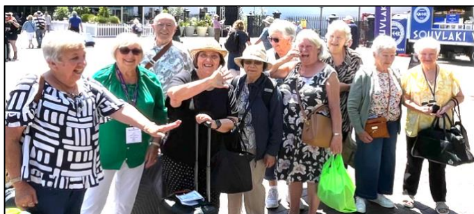
12 members joined the Southern Aust Explorer Cruise - 24 Oct - 4 Nov 2025 on the Crown Princess.