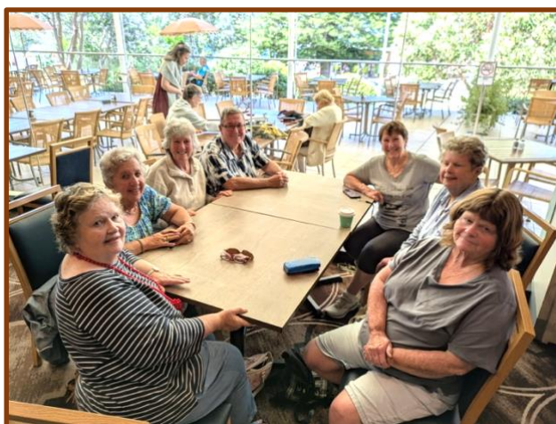
A late change of venue due to high wind at Woy Woy Waterfront. 7 members read the email and enjoyed Morning Tea at Diggers.