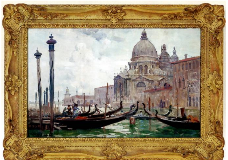
"La Salute, 1908" Arthur Streeton Oil on canvas. (535 x 845mm)

Time to try dabbling in paint again. We haven't had our brushes out for a while.