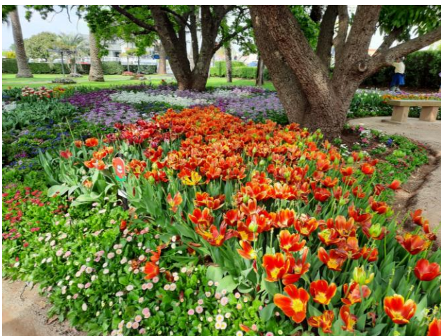
Laurel Bank, Toowoomba

When it's spring again, I'll bring again Tulips from Amsterdam With a heart that's true, I'll give to you Tulips from Amsterdam I can't wait until the day you fill these eager arms of mine Like the windmill keeps on turning That's how my heart keeps on yearning For the day I know we can share these tulips from Amsterdam La-la-la, la-la, la-la, la-la, la-la-la-la, la-la La-la-la, la-la, la-la, la-la, la-la-la-la, la-la