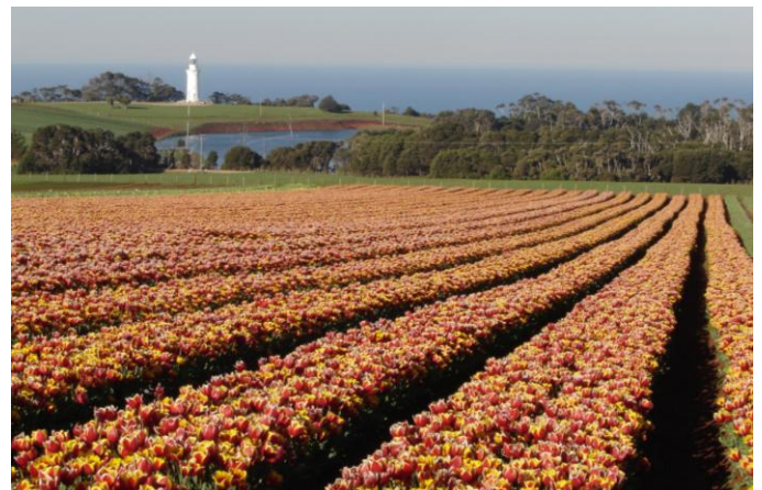
Table Cape, Tasmania