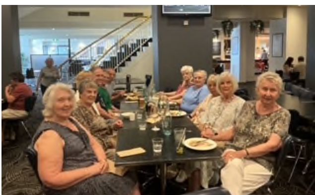
A couple of pics from recent events - from Anne