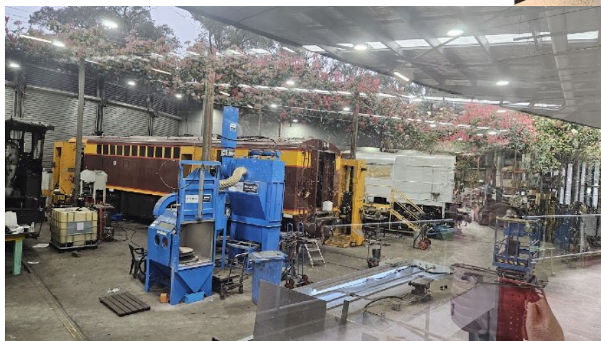
Left, huge workshop where trains are restored.