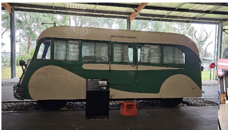
Left: The Rail Pay Bus

Below: Accomodation for someone's " last train ride " to the cemetery