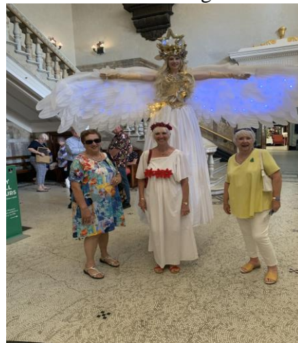
Lord Mayors concert – City Hall