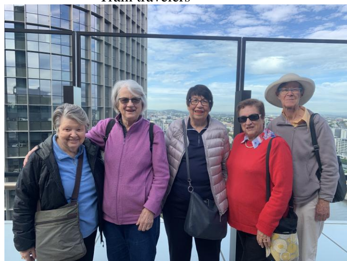
Sky Deck Walkers!