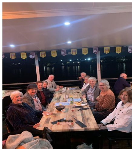
Mystery Dinner at Merthyr Bowls Club