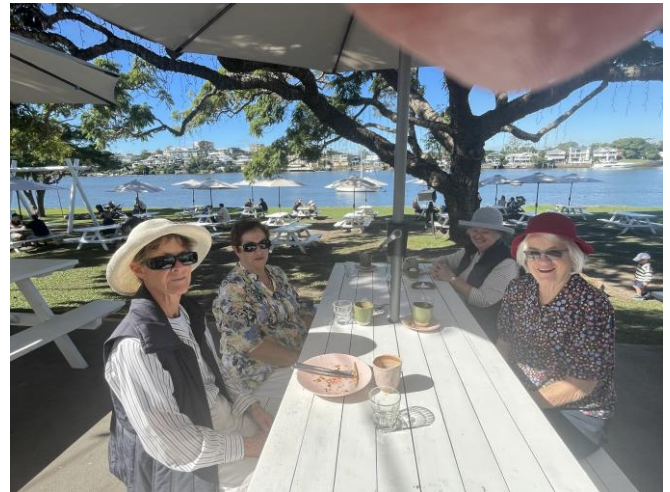
The Officer’s Mess!