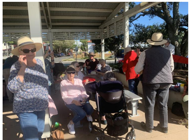
Fish and Chips at Sandgate