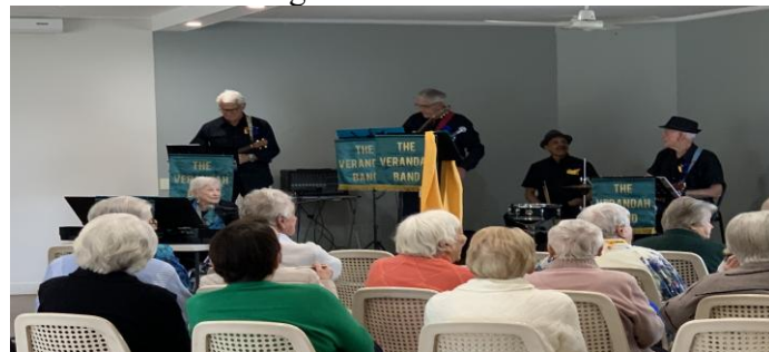
The Verandah Band