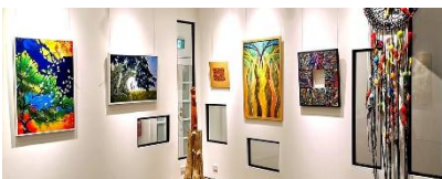
Welight Art Space image used with permission

Guided all the way by a professional artist, this will be a fun 2.5 hours. Painting experience is not necessary.