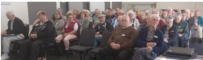
Members at the November meeting.