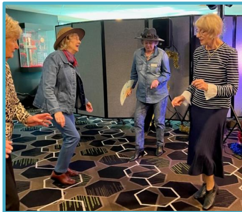
Just two cowboys having a rockin' good time