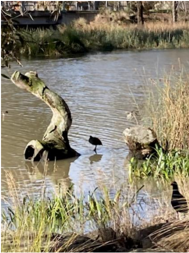
Fresh air, Nature, gentle walk and conversation