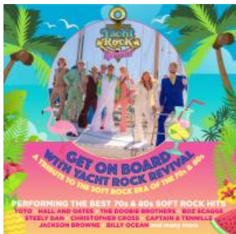
Table 9 now has four seats unsold for this Oct 18, Dinner and Dance night at CBD Central. Seven of you answered this first call, thank you. Now we need just four more! If you want to come, please commit to me below, and I'll book the remaining seats - they are around $80.50 each for dinner and show - it'll be a great night out!