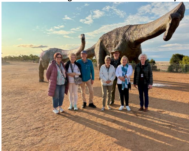
At the Australian Age of Dinosaurs Centre - 26 July