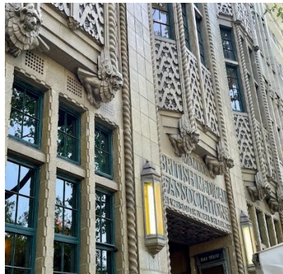
The BMA Building