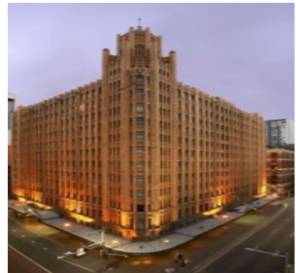
The Grace Hotel