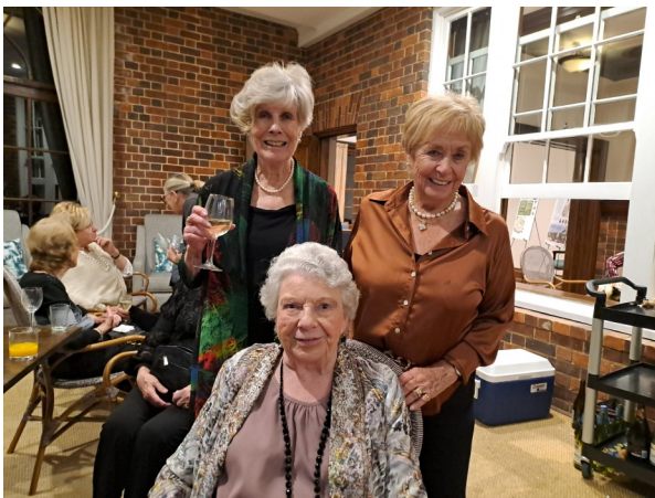
Soiree at Lober House, ARV Castle Hill on 17 September 2025