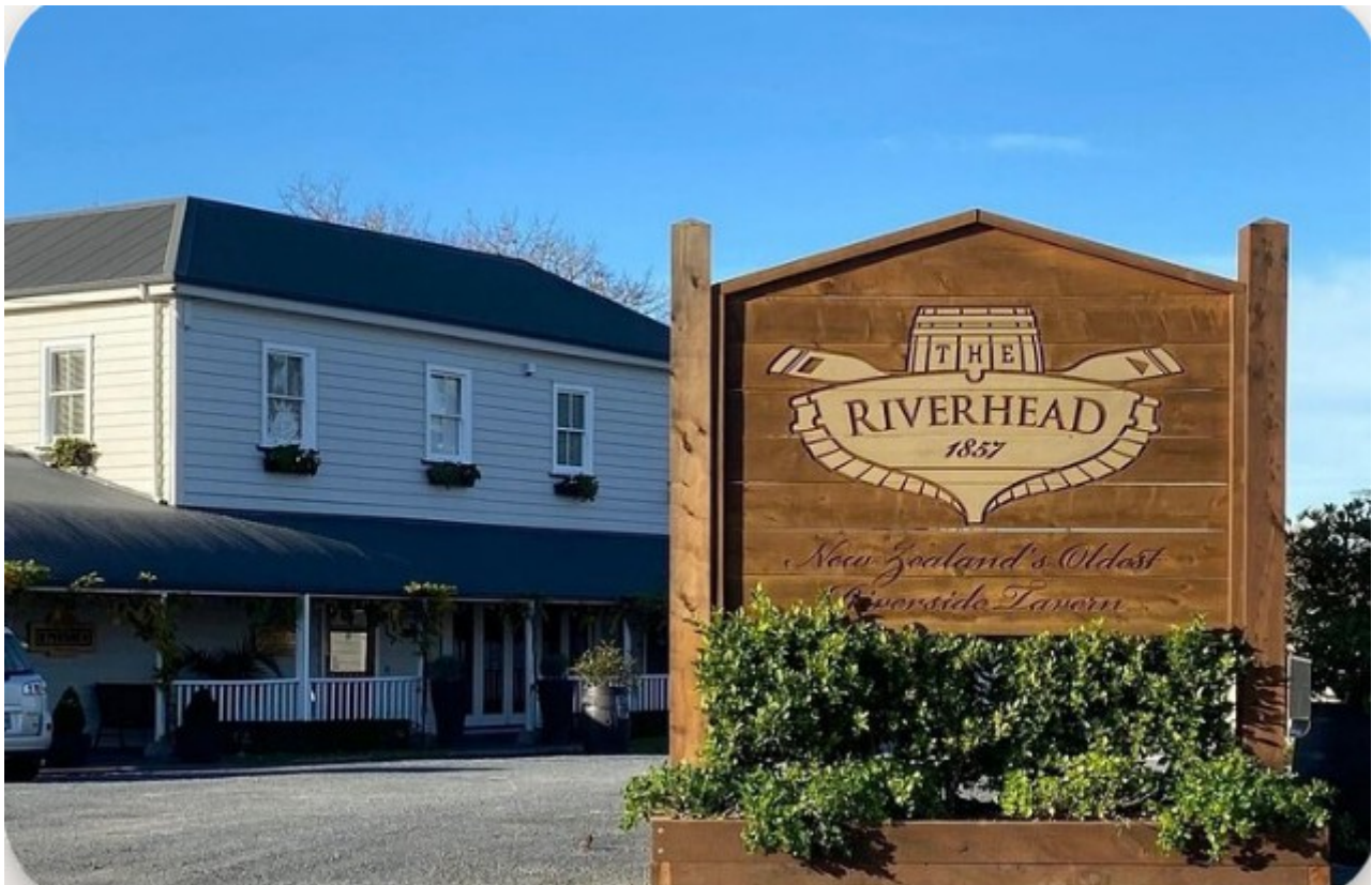
The Riverhead today.