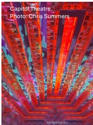
Capitol Theatre.

Radio broadcasts began with 3AR, 3LO and later 3UZ. Car registrations peaked with 82,500 registrations. Ford opened in Geelong in 1925, Chevrolet in Melbourne in 1926. Hosiery was 5/11d per pair and there were mills in Brunswick and Coburg. A lady on average bought 12 pairs a year. Hairdressing was booming.