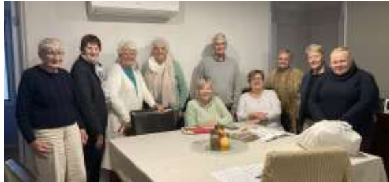
Stitch and Chat visit