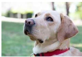
Autism Assistance Dogs