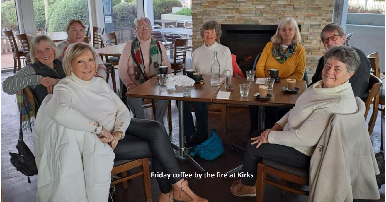
Friday coffee by the fire at Kirks

Our monthly meetings seem to come round quickly. Is it our age that makes time fly?