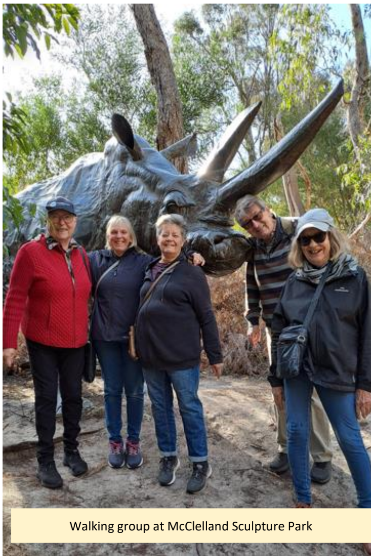
Walking group at McClelland Sculpture Park