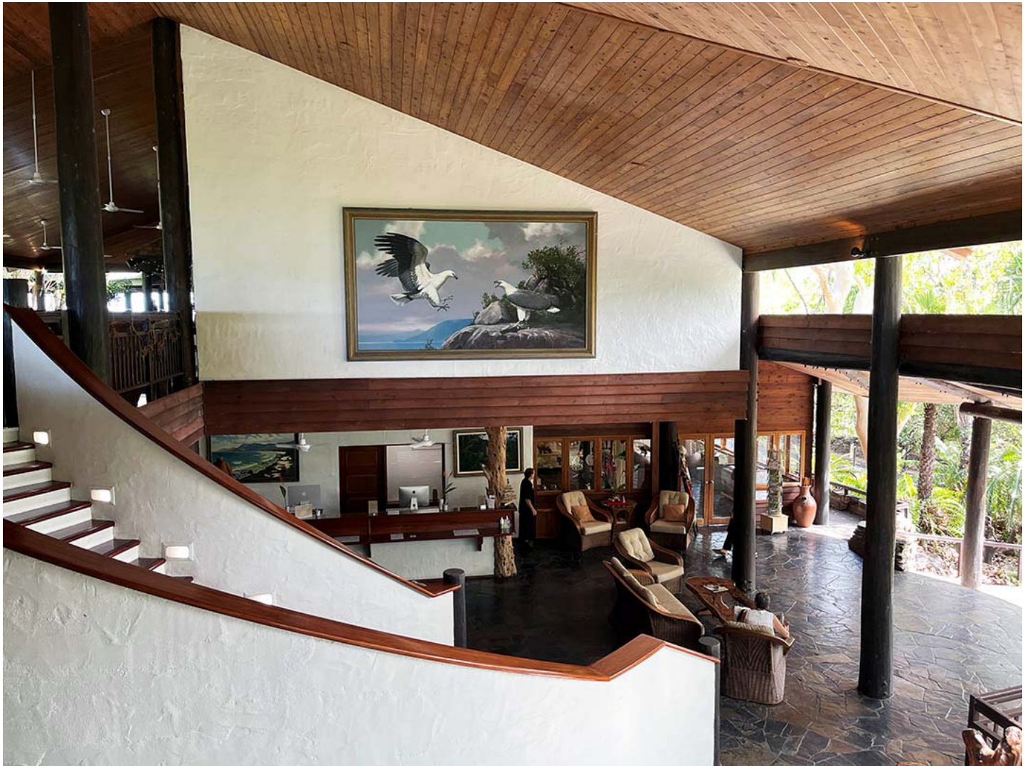
Thala Beach Eco Resort Lobby