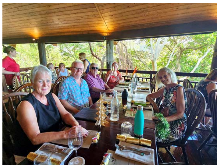
There were several tables to cater for the large gathering