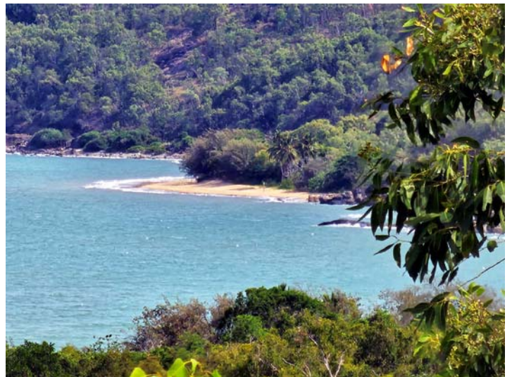
Beautiful beaches that provided our backdrop

Meeting day/time: 4 th Monday of every month at 9:30 am (except January which is 3 rd Monday)