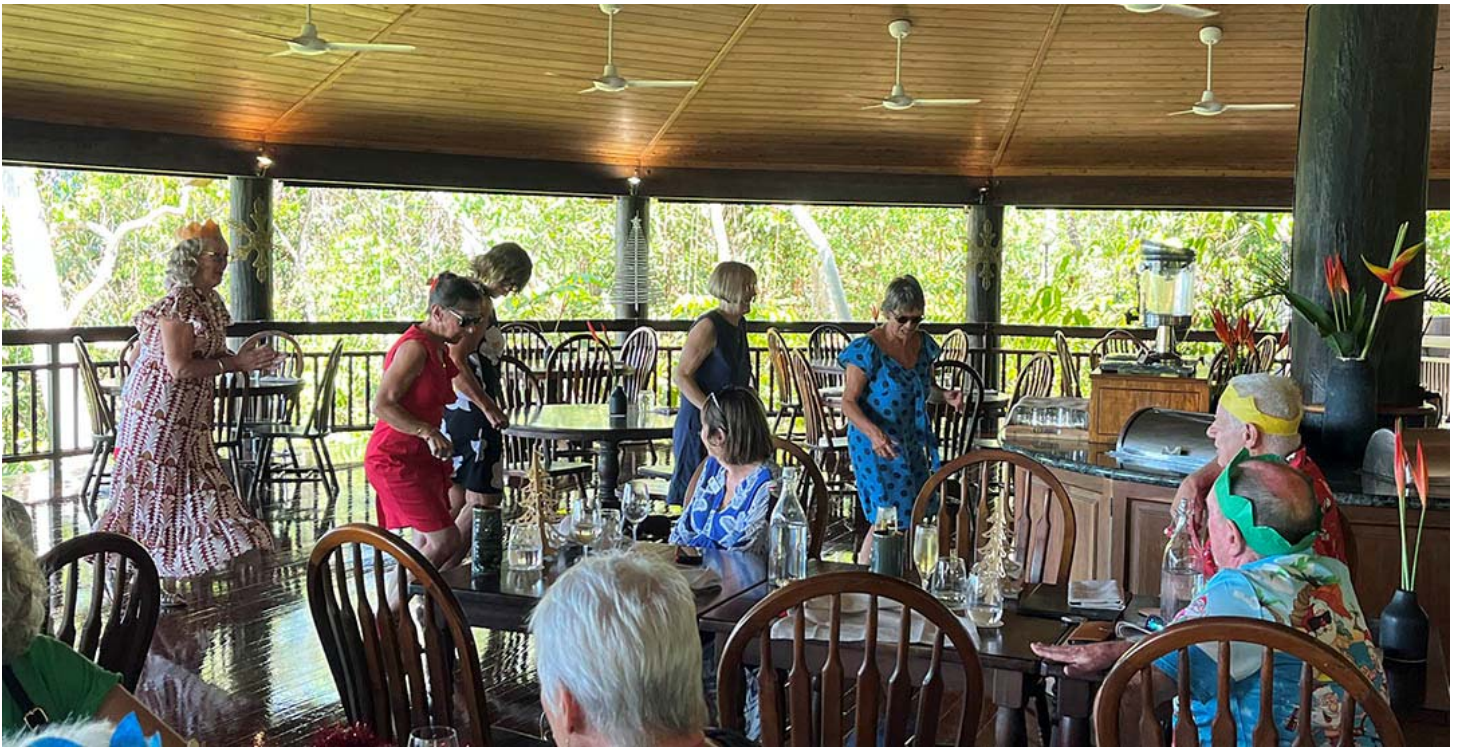
An impromptu line dance performed by the ladies from the dance group was joined by several other members for a fun afternoon

Meeting day/time: 4 th Monday of every month at 9:30 am (except January which is 3 rd Monday)