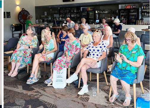
Members at the meeting

The middle bottom photo shows the losses in Australia from scams over the last five years. It's heartening to see from the graph that we as a country have seemed to pass the worst of it and the graph is now trending downwards. This is largely due to the large organisations spending million to protect all of us, but it is still up to each of us to be vigilant!