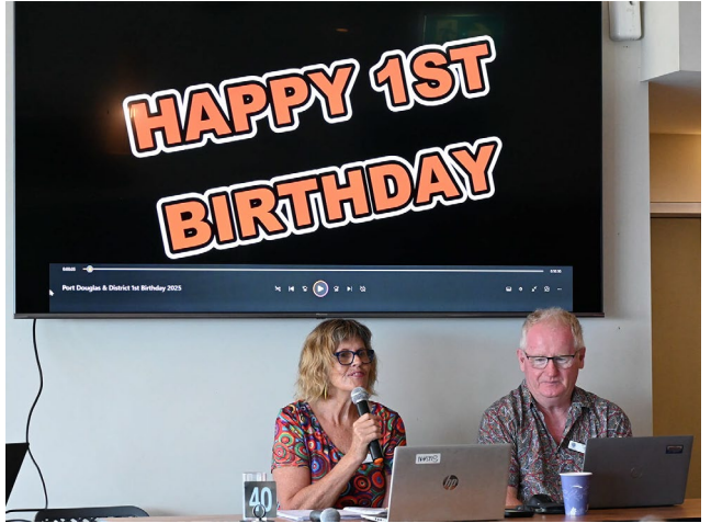
Our 1 st Birthday meeting which was followed by party pies and of course a cake to celebrate with.