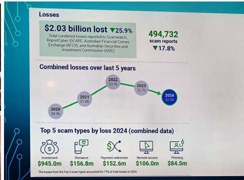
Scams cost the community