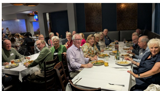
Dinner at The Malvernvale Hotel

Paper copies of the newsletter will available from the May meeting