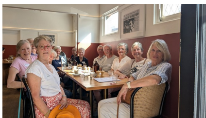
Coffee morning at The Pantry Glen Iris