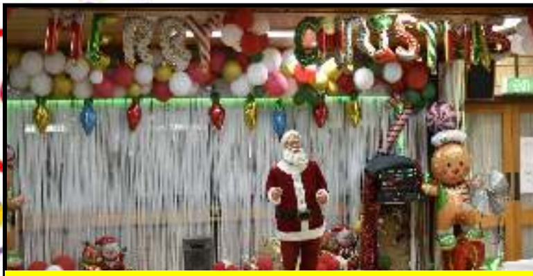
December meeting—Airport Over 50s Club Christmas Decorations