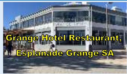
Grange Hotel Restaurant, Esplanade Grange SA

On Friday evening 16th February 2024, 17 people enjoyed the hospitality, friendship and food at the Grange Hotel Restaurant