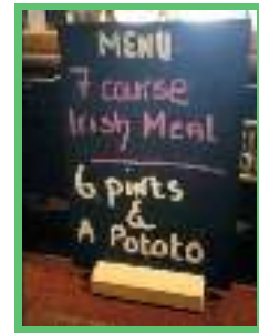
Irish Pub Menu