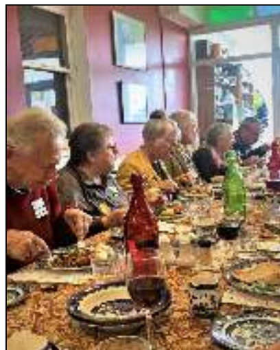
Enjoying 3 course lunch