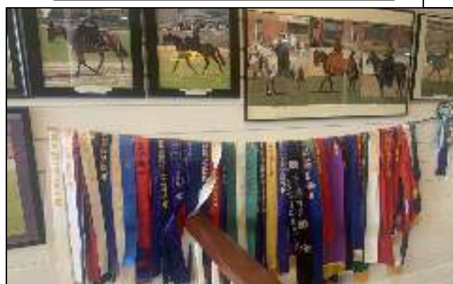
Prize Winning Ribbons