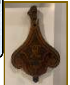
Figurehead from the 'Star of Greece'

On July 13, 1888 , in the early hours of the morning, Star of Greece was wrecked just off the beach at Port Willunga. 'Star of Greece' was part of the Calcutta jute trade for most of its time, and established a sailing speed record that was never broken. The ship was remarkable for the amount of brass on deck, and was thought to be the handsomest ship to ever enter Port Adelaide.