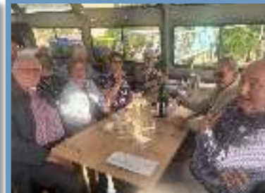
Members and Friends aboard the Boat