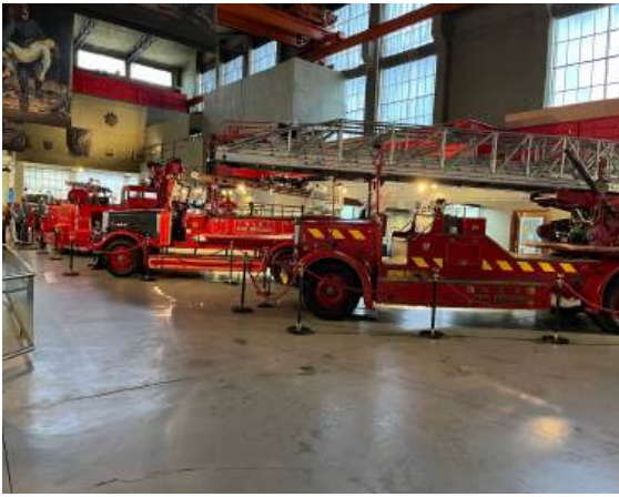
Penrith Museum of Fire ..... Continued