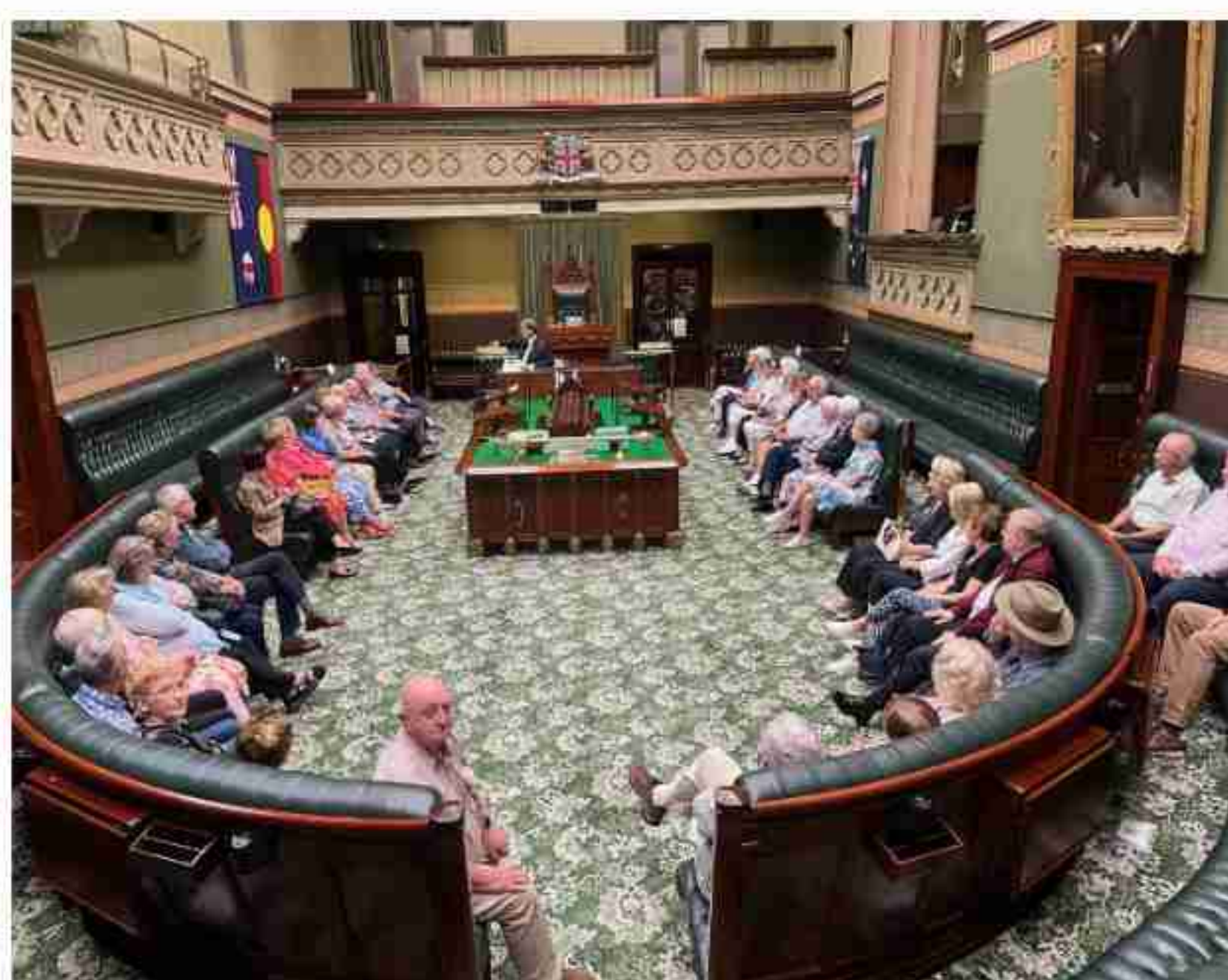
The Legislative Assembly Chambers