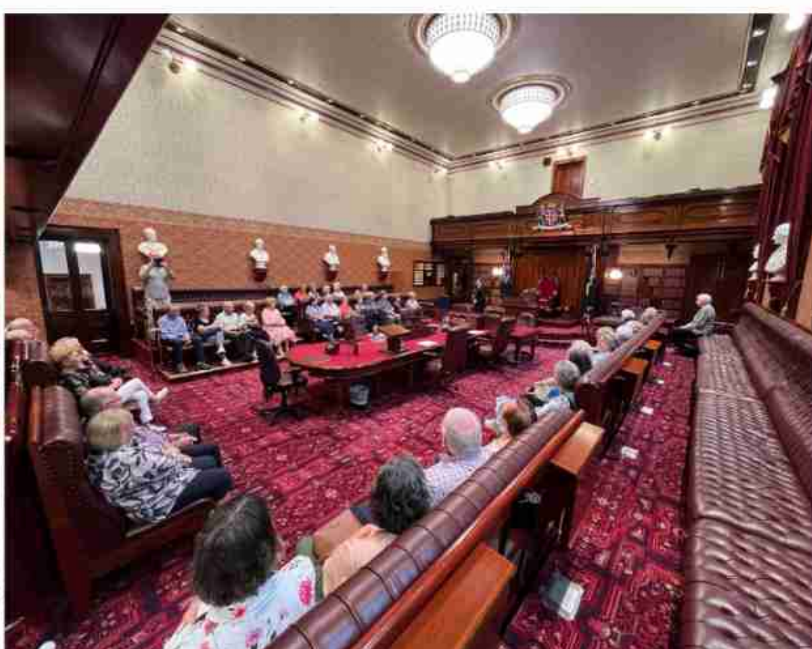
The Upper House - The Legislative Council

the Black Rods used in Opening of Parliament, the chair reserved for the Monarch or his representative, and the Hourglass gifted to our Government by King Charles III in 2024 to celebrate the Bicentenary of the Legislative Council, used to time the ringing of the bells, or divisions.